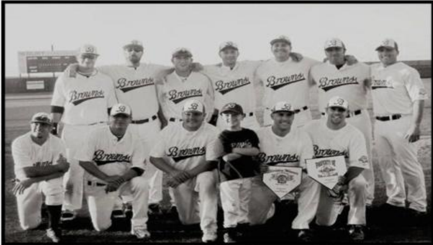
2010 Champions “The Denver Browns” 20-3 Record